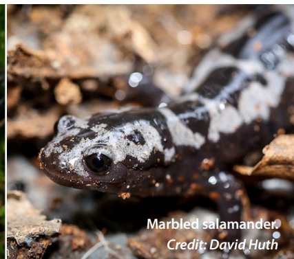
Marbled salamander