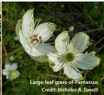
Large-leaf grass-of-Parnassus