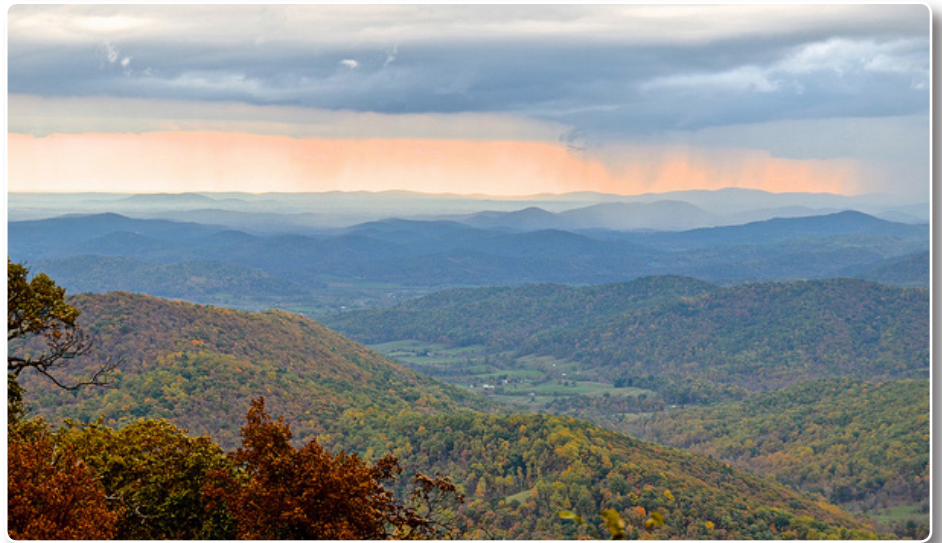
Shenandoah National Park.

Year after year, regions across the U.S. and around the world continue to report record temperatures, extreme weather events, and dramatic shifts in precipitation resulting in droughts in some areas and flooding in others. Based on the best available science and recorded observations, this continuing trend is expected to accelerate as the century moves forward. Along with current environmental, economic, and social changes that are influencing the landscape, climate change will augment these developments, affecting habitats and species in different ways. Understanding the potential risk and vulnerability of species and habitats to climate change within the Appalachians – a region rich in unique biodiversity found nowhere else on the planet with nearly 200 federally listed threatened or endangered species- is of critical importance and thus a major research priority for the Appalachian LCC.