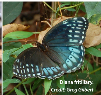
Diana fritillary.